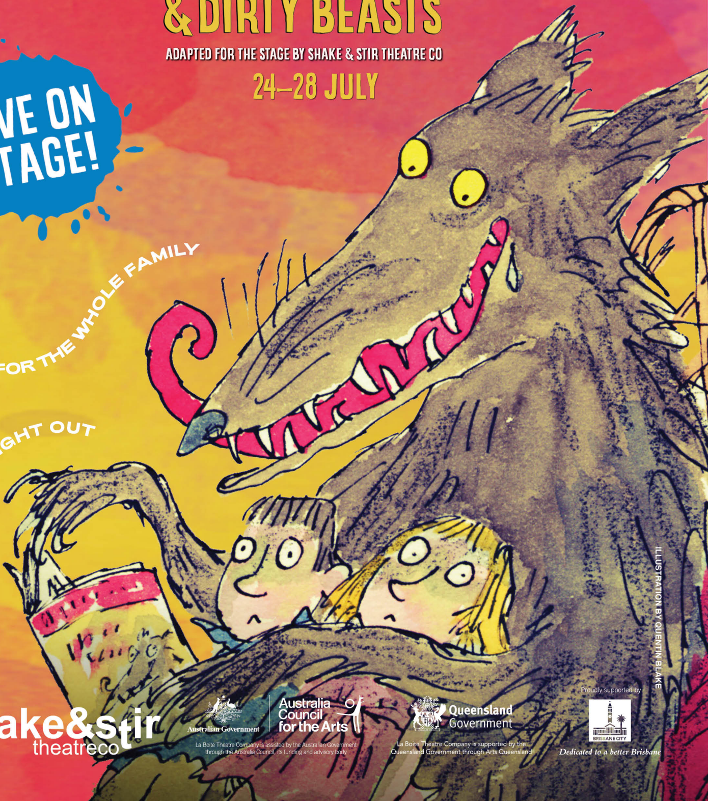
ILLUSTRATION BY QUENTIN BLAKE